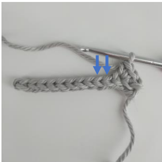
Work through 2 top loops