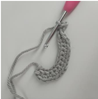
Ss in 2nd ch from hook