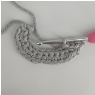
Ss in the blo across